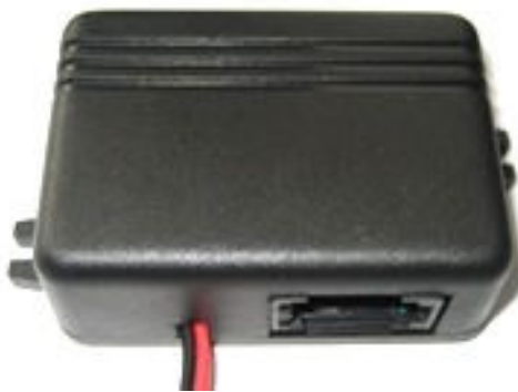
Figure 1. Module appearance.

If there is no sound after installation and assembly of the optical ring, you must reset the head unit by pressing and long holding (more than 8 seconds) power button "On" command.